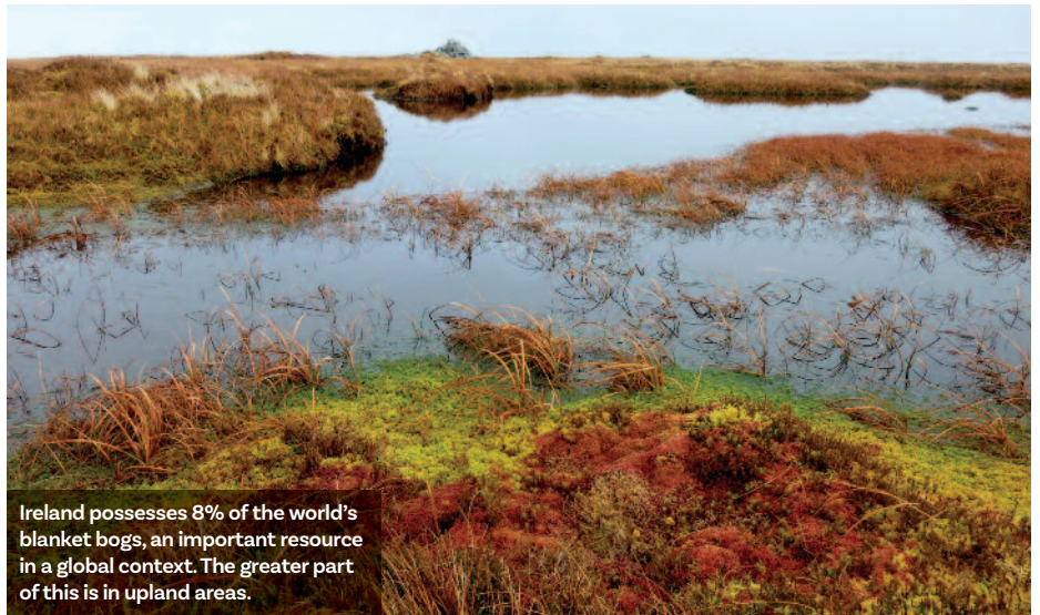
Ireland possesses 8% of the world's blanket bogs, an important resource in a global context. The greater part of this is in upland areas.

clubs and individual members to celebrate Ireland's mountains and upland areas, to show that these areas are special and worthy of greater attention and investment, and that they must be conserved and looked after for the benefit of future generations.