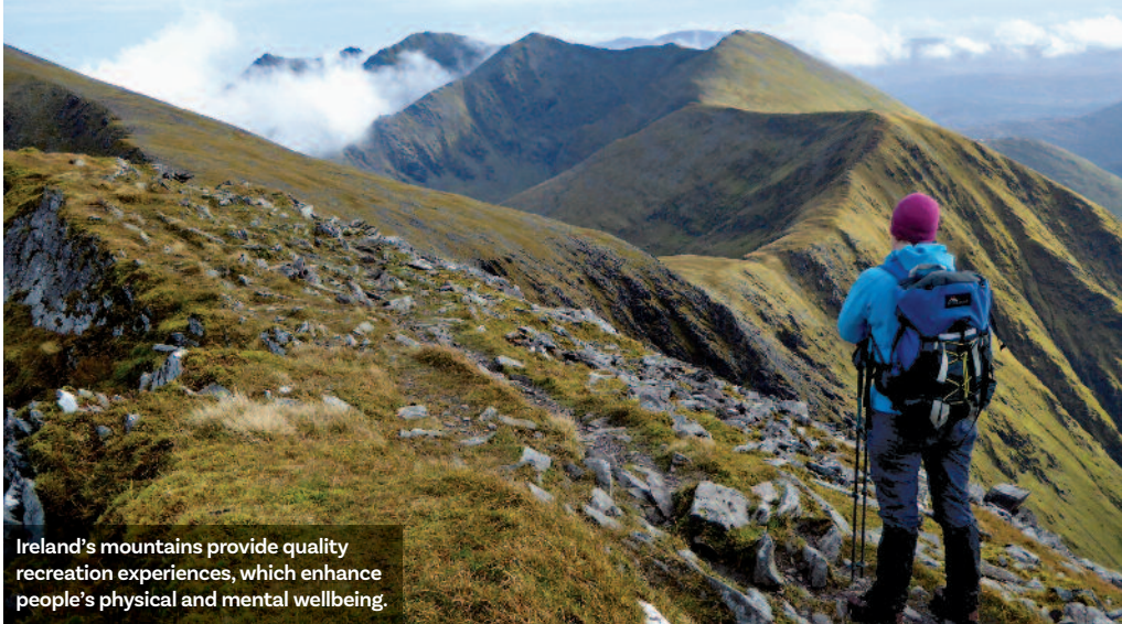
Ireland's mountains provide quality recreation experiences, which enhance people's physical and mental wellbeing.

Fáilte Ireland's annual Visitor Attitudes Surveys consistently show that the friendliness of the people, the beautiful scenery and the natural, unspoilt environment are the main factors that influence overseas visitors in choosing Ireland as their holiday destination.